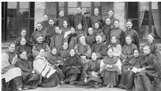
Members of the China Inland Mission in Chinese garb, Hudson Taylor is seated in middle of second row and wears a long white beard